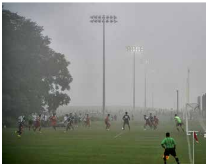
Figure 4. Sports Fields Vision