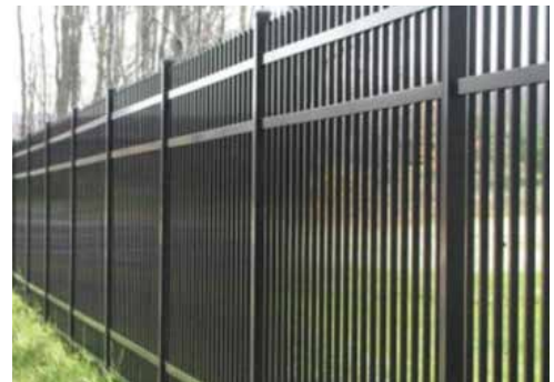
Figure 7. Example of buffer fencing type

Parking lot layout, landscaping, buffering, and screening shall be provided to minimize the direct view of parked vehicles from streets and sidewalks, avoid spillover light, glare, noise, or exhaust fumes onto adjacent residential properties, and provide the parking area with a reasonable measure of summer shade ( Figure 8 ). Planting, fences, walls, berms, or a combination thereof, not