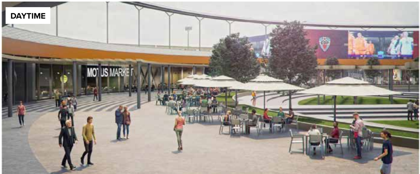
Figure 9. Circus area character images