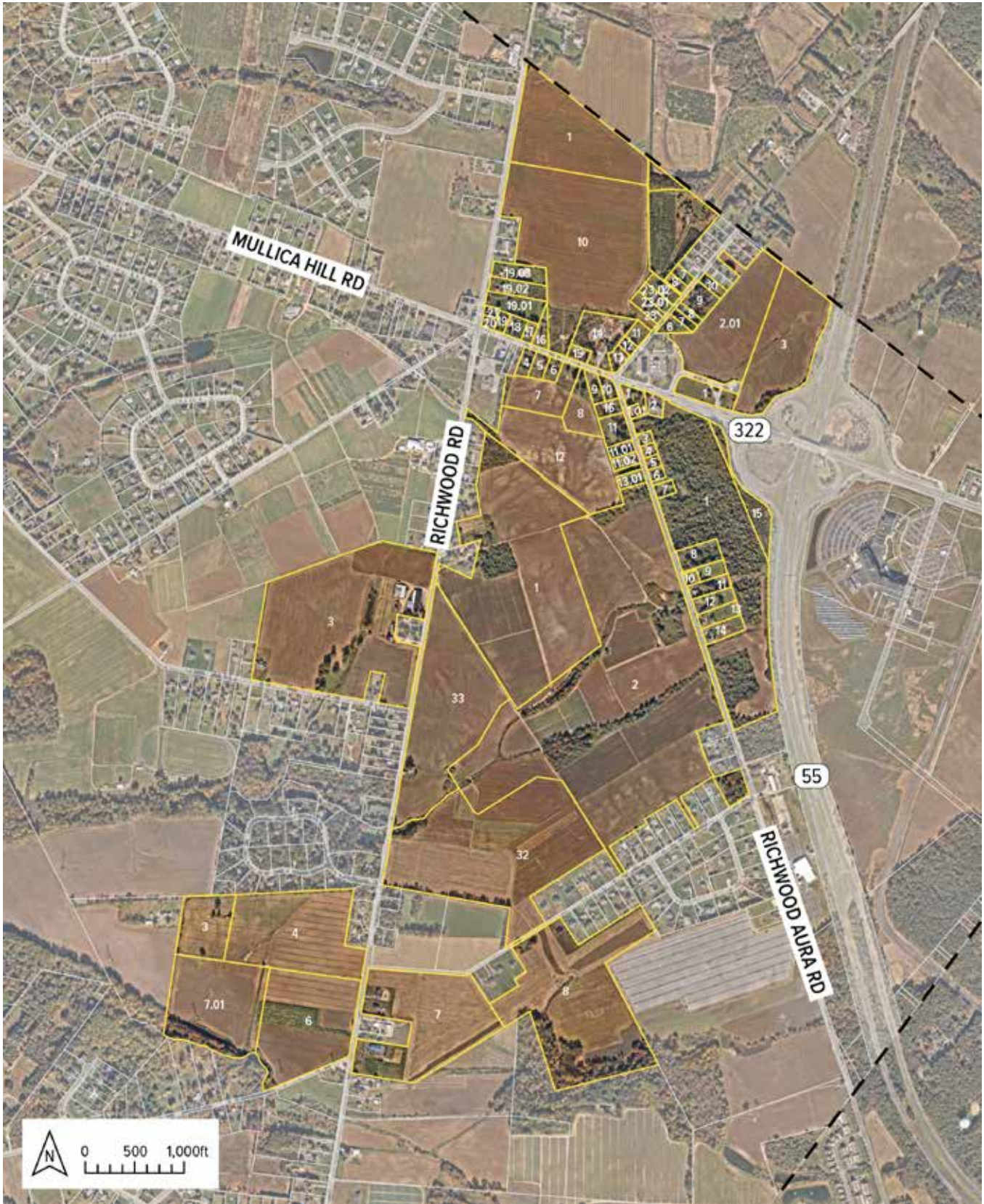
Figure 1. Richwood Redevelopment Plan Lots