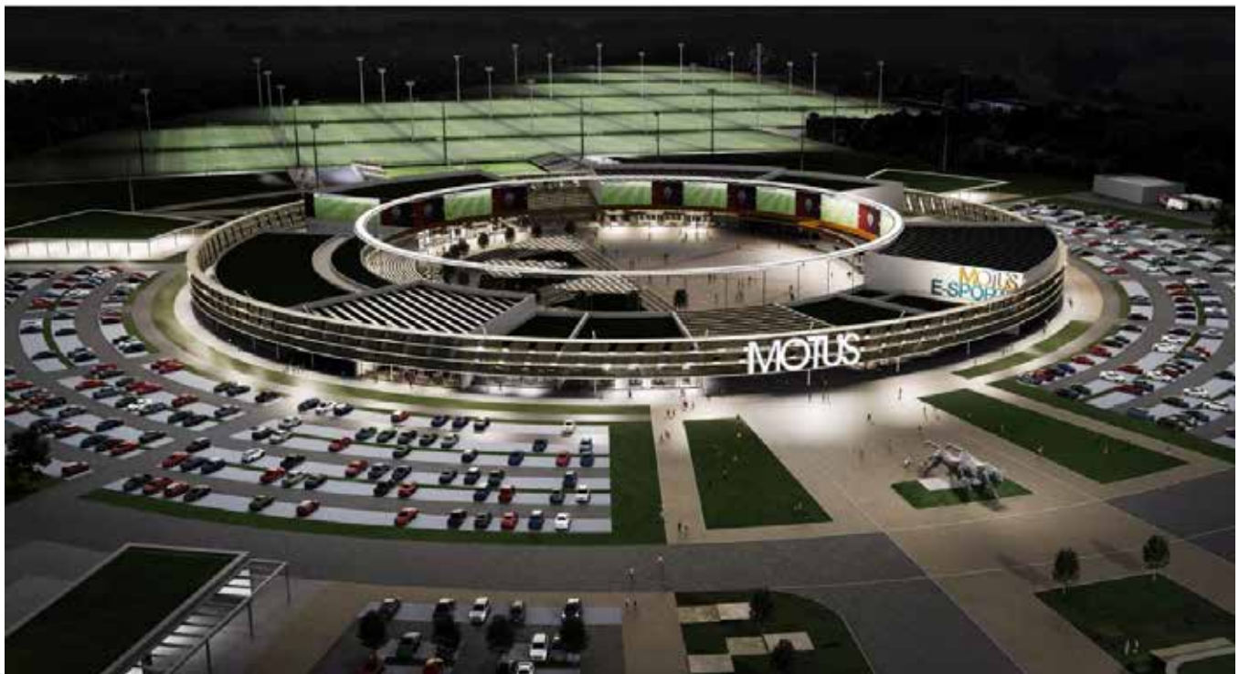
Figure 2. MOTUS Aerial Rendering of proposed Circus Area