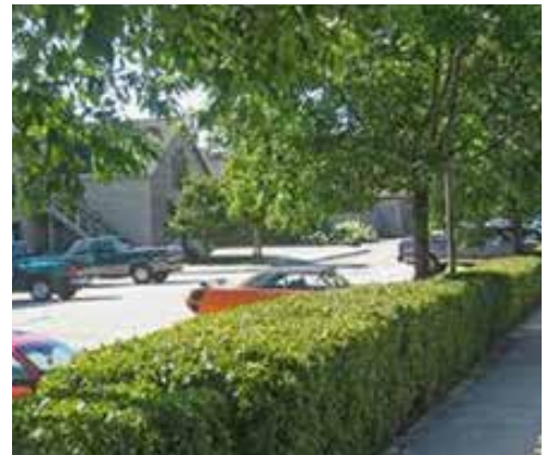
Figure 8. Example parking lot buffer